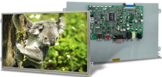
Resistive Touch Panel