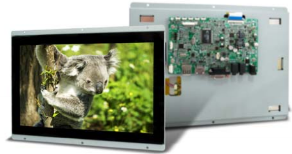
Projected Capacitive Touch